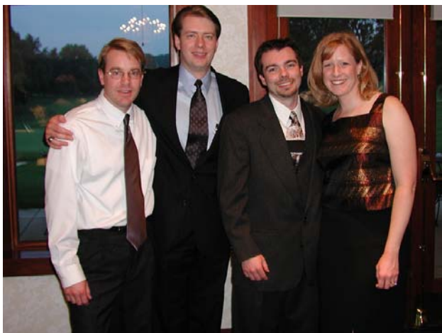
The graduating residents