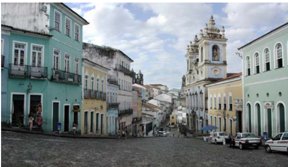
Largo de Pelourinho, Salvador